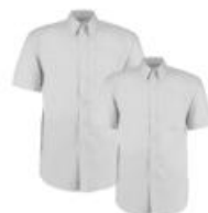
Twinpack Shirts/Blouses From £14.50