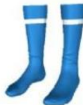
PE Socks From £6.95