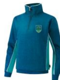
¼ Zip PE Top £25.00