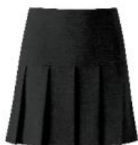
Skirts From £10.25