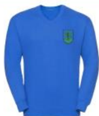
V Neck Sweat from £14.95