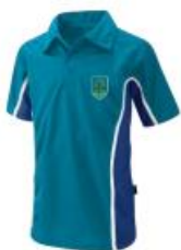
PE Polo £15.95