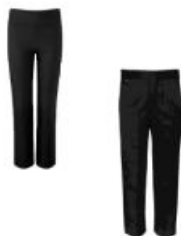
Trousers From £7.00