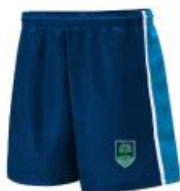
PE Shorts £12.95