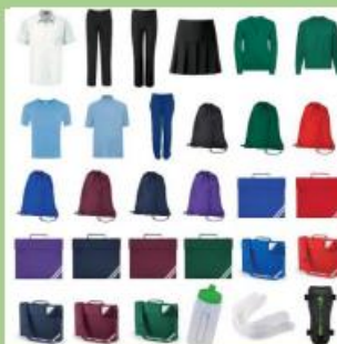
PLAIN SCHOOLWEAR, BOOK BAGS AND ACCESSORIES